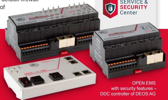
OPEN EMS with security features – DDC controller of DEOS AG