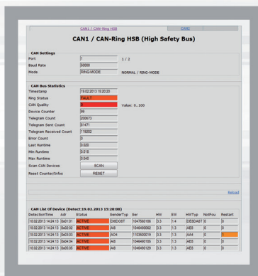
Functions and diagnostic options

For the safe operation of CAN-HSB, both CAN-interfaces of an OPEN 3100 EMS C2 or an OPEN 4100 EMS C2 will be used. With these interfaces the field level can be operated in a ring and therefore it is possible that the field devices can be operated during an interruption from the functional side.